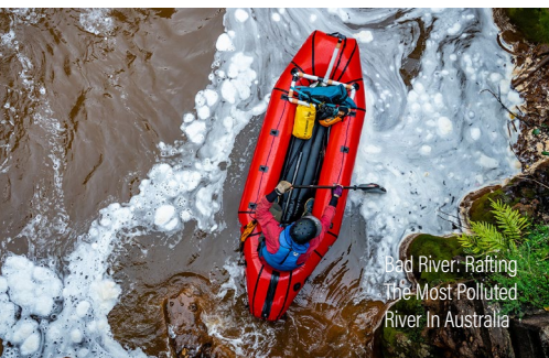
Bad River: Rafting The Most Polluted River In Australia