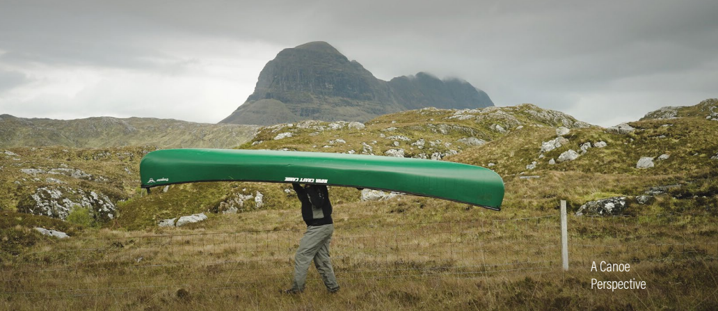
A Canoe Perspective