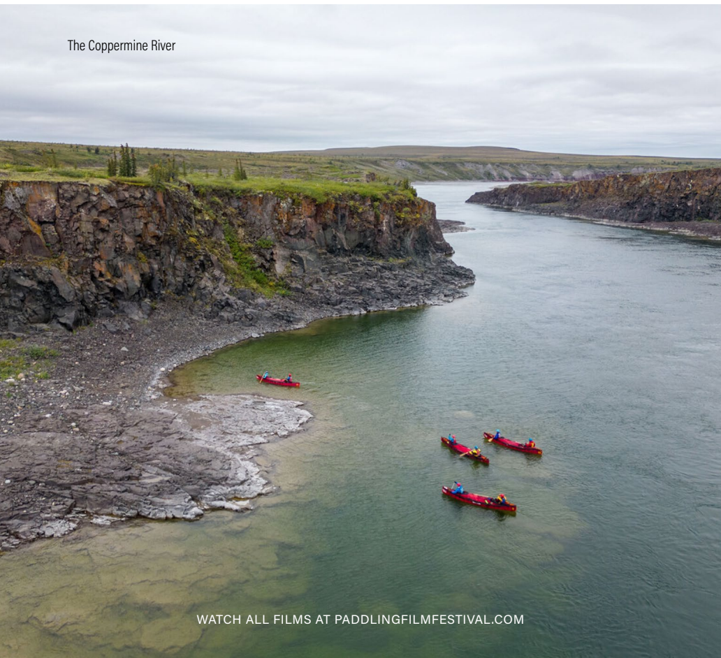
The Coppermine River