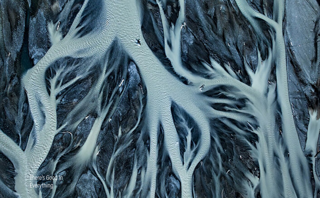
There's Good In Everything