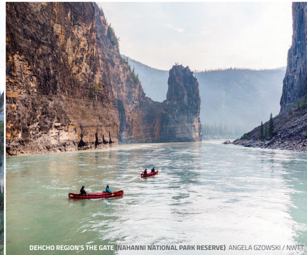
DEHCHO REGION'S THE GATE (NAHANNI NATIONAL PARK RESERVE)