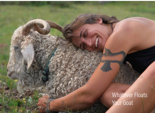
Whatever Floats Your Goat

WATCH ALL FILMS AT PADDLINGFILMFESTIVAL.COM