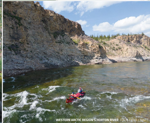
WESTERN ARCTIC REGION'S HORTON RIVER COLIN FIELD / NWT