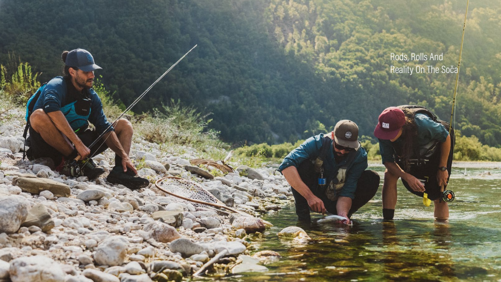
Rods, Rolls And Reality On The Soča