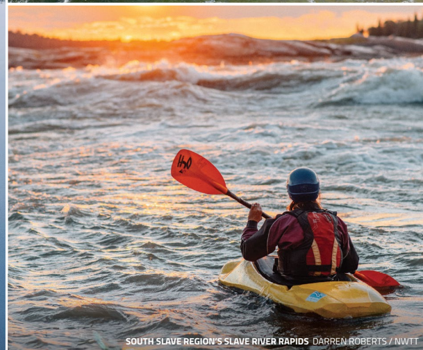
SOUTH SLAVE REGION'S SLAVE RIVER RAPIDS

Canada's Northwest Territories has a longstanding reputation for unforgettable canoeing, kayaking, and rafting adventures. These fabled waterways can take you across the tundra to the coasts of the Western Arctic, down the rapids of the South Slave, through the mountain-flanked canyons of the Dehcho, and to the storied banks of the Sahtu. Once you've paddled in the NWT, you'll understand why people say something here will change you. In every region, the trip of a lifetime awaits you, here in the Northwest Territories.