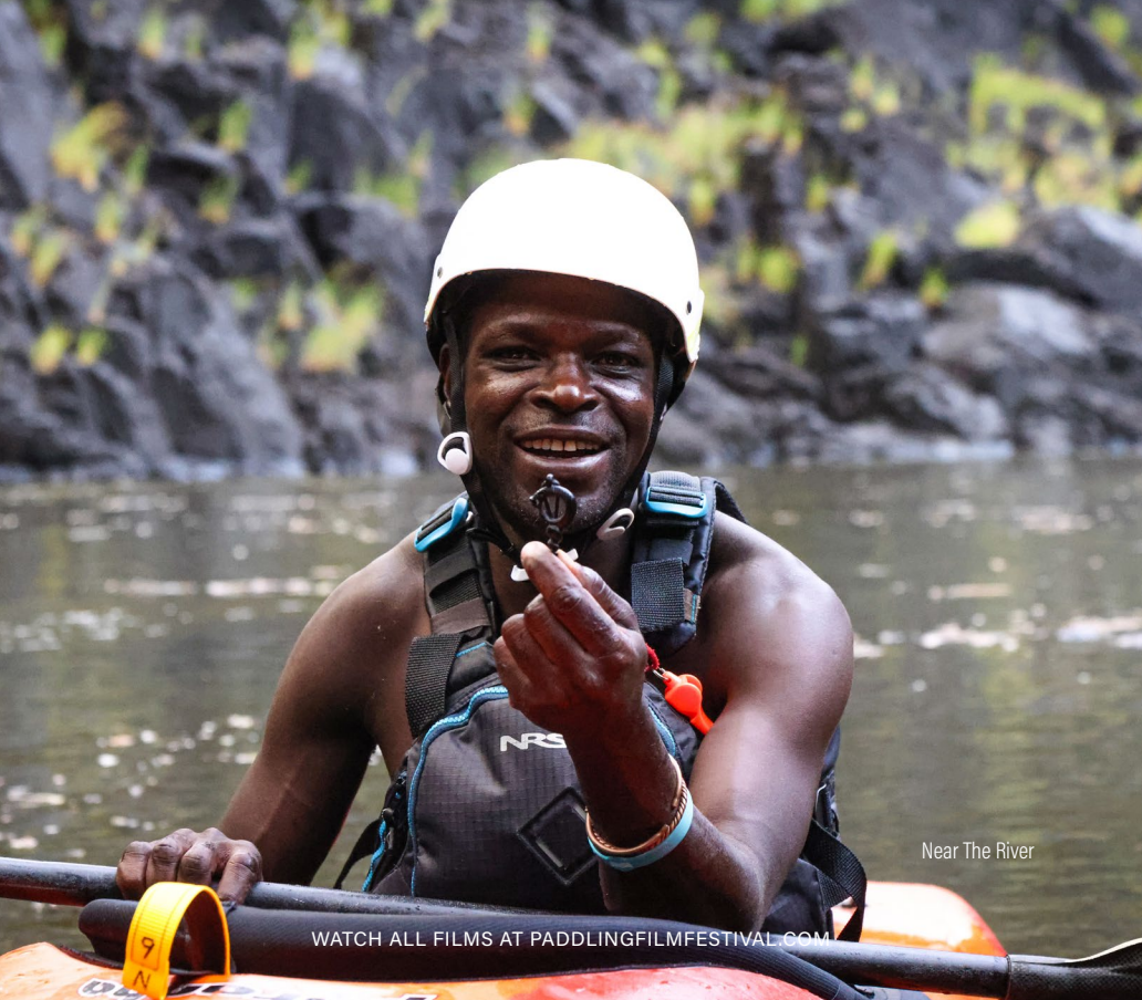
Near The River

WATCH ALL FILMS AT PADDLINGFILMFESTIVAL.COM